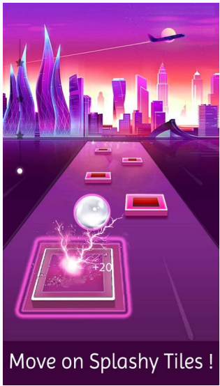
Move on Splashy Tiles!